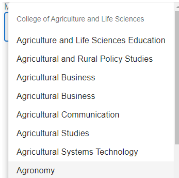
Figure 1.1: User Info Majors List ALS Subheader.